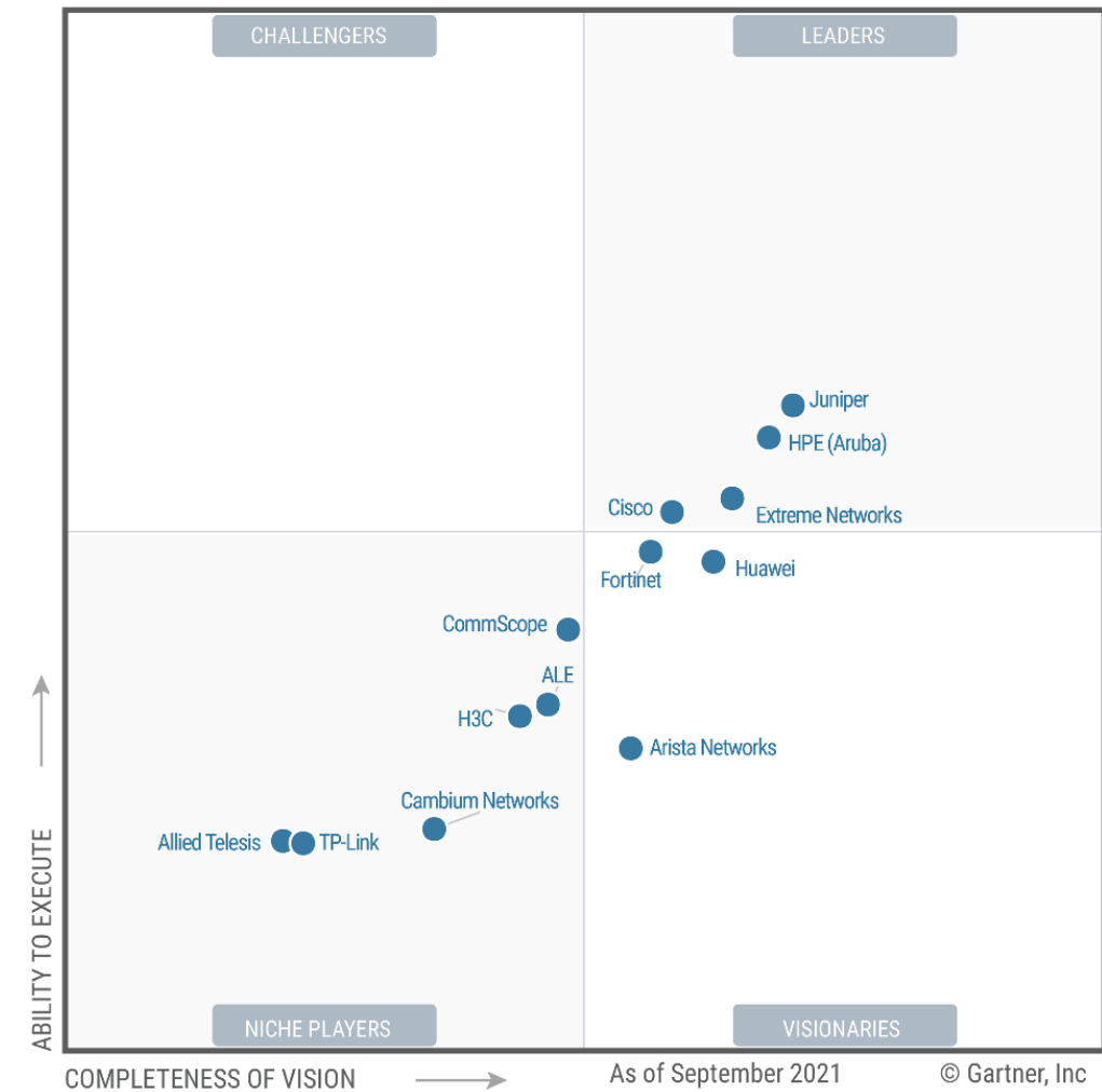
Figure 1. Magic Quadrant for Enterprise Wired and Wireless LAN Infrastructure