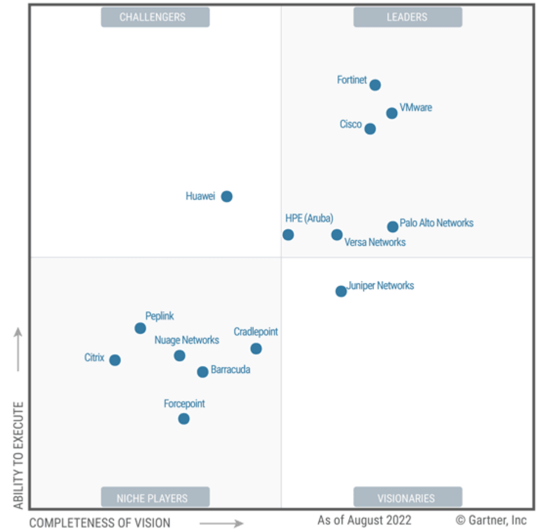
Figure 1: Magic Quadrant for SD-WAN